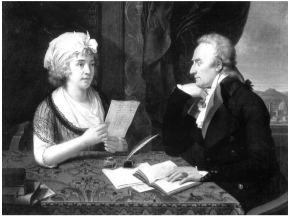
fig.2- François Xavier Fabre Double portrait of Alfieri and the countesse of Albany Turin, Civic Museum of Ancient Art All rights reserved