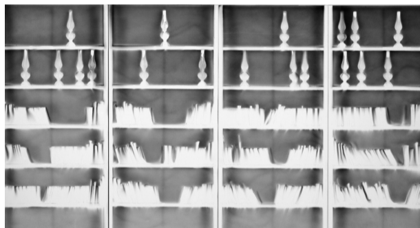
fig.2- Shadow Sculptures Created by Claudio Parmiggiani in 2002 before the restoration of the library and its incorporation in the Musée Fabre

On the first floor was the library, which had been considerably enriched by the Fabre donation of nine thousand volumes, including Vittorio Alfieri's own library, the Italian poet he knew in Florence. The reading room opened onto a medals room installed in the east pavilion. The walls of this room were almost completely covered with cases displaying the small precious objects that belonged to Fabre (some of these works are displayed in the cases dedicated to the museum's donors in Room 12). In the public room, spiral staircases in the corners led to a wooden gallery where the precious and rare books were housed. This wooden structure existed throughout the twentieth century up to the interventions of Georges Rouse and Claudio Parmiggiani during the 2002 renovation (fig.2).