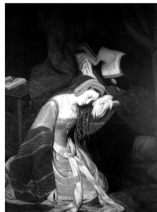
fig.3- Edouard Cibot Anne Boleyn in the Tower of London , 1835 Autun, Musée Rolin