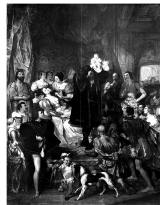
fig.2- Eugène Devéria Birth of Henri IV Paris, Musée du Louvre

With his Interior of an Underground Church *, Granet (1775-1849) offered a more picturesque and anecdotal Troubadour style quivering with Romanticism in its disturbing chiaroscuro and the morbid nature of the scene. As a forerunner to Michelangelo in his Studio * by Delacroix (Room 32), in Montaigne visiting Tasso * Granet depicts the saturnine figure of the great poet a prey to doubts about the creative act when face to face with the humanist philosopher.